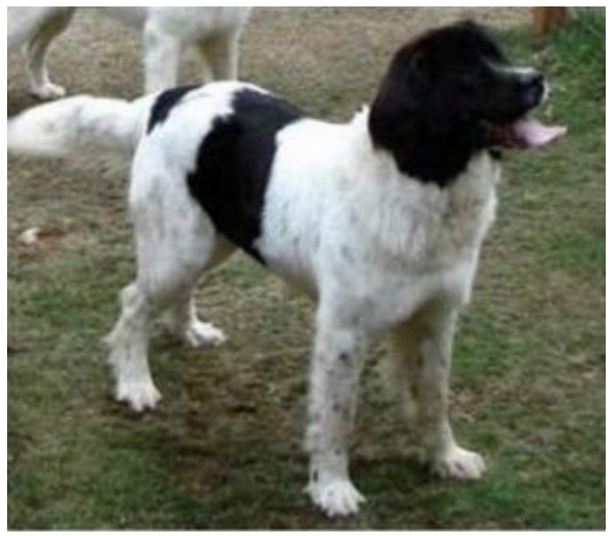
(Female) Ginger vom Nebalwald from Germany.(deceased) Litters A & B – total of 16 puppies