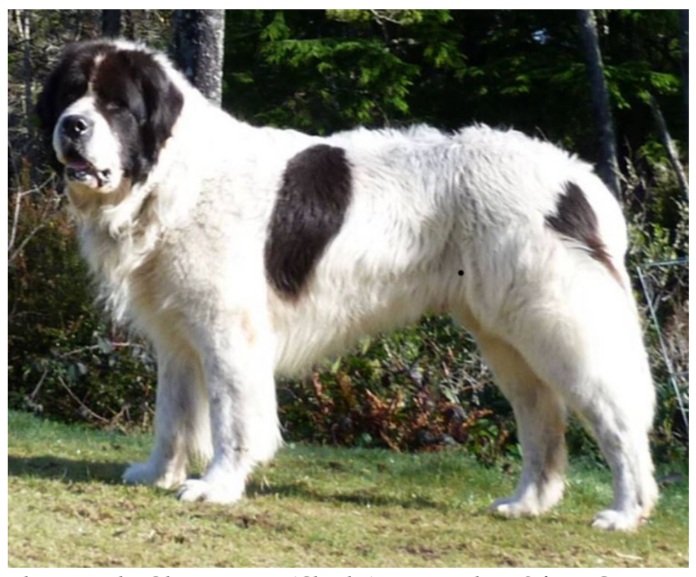
(Male) Foundation male, Oli von Fierst (Charlie) came to the US from Germany (deceased) Litters A & B - 16 puppies (natural breeding)