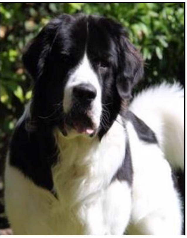
(Male) Vitus von set Burg Wettin (Maverick) from Germany, lives in California Litters I, L& O - 24 puppies (frozen insemination)