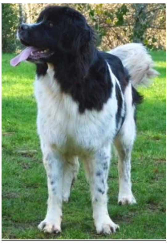
(Female) Bea from the Pacific Coast, lives in Oregon, moving to Germany Litters H, J , L & O - total of 23 puppies