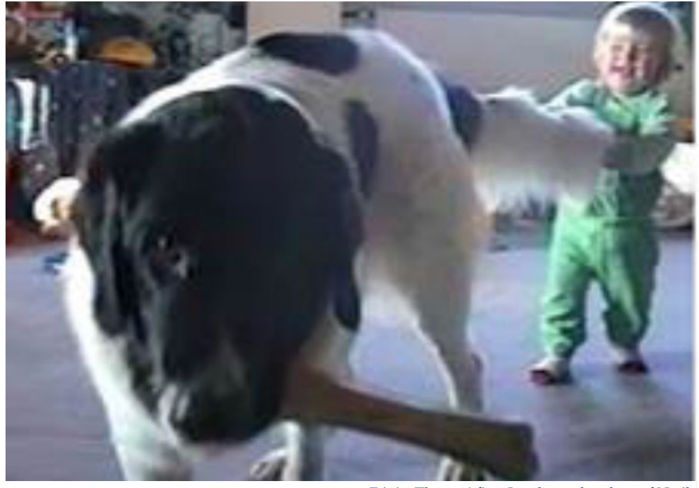
4 – Dixie, Thomas' first Landseer, daughter of Uttilo