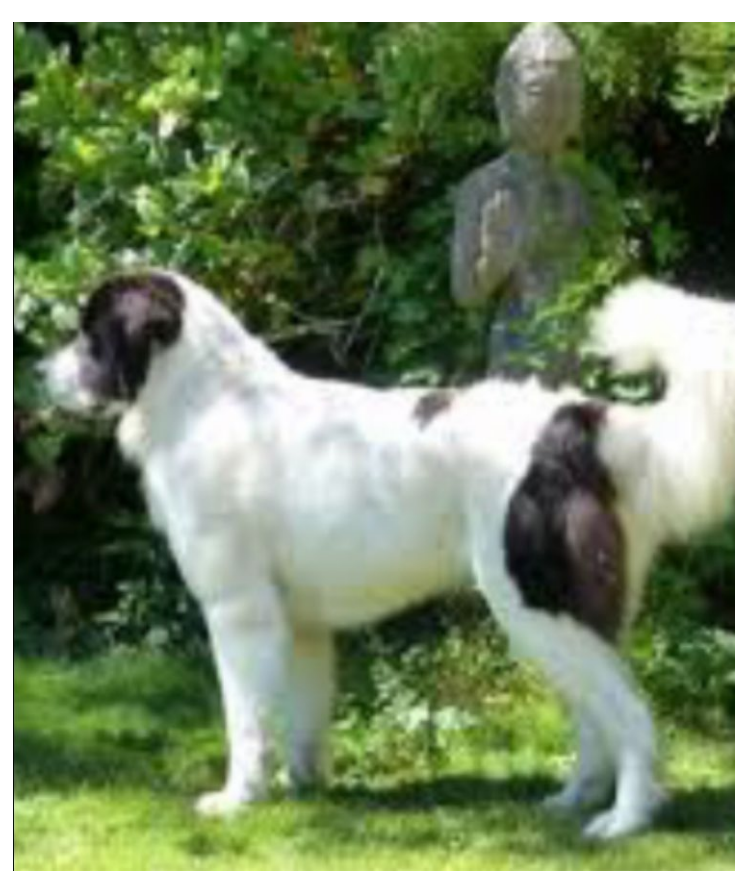
(Female) Ivory from the Pacific Coast, lives in Washington Litter M - 1 puppy