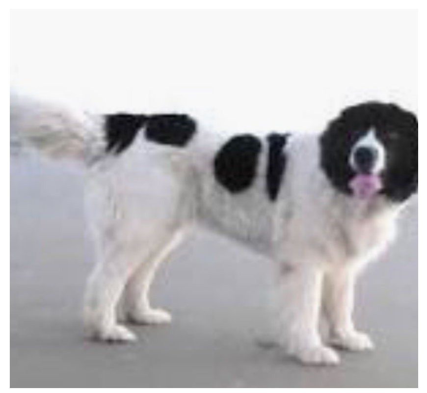
(Female) Apenayaa's Angelic Charmaine (Angie) from Denmark, lives in Oregon Litter G - 4 puppies