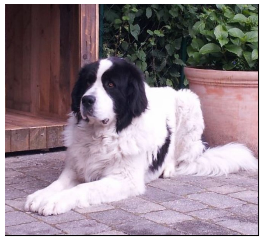
(Male) Enzo vom Kammersteinerland from Bavaria, Germany Litter E - 8 puppies (frozen insemination)