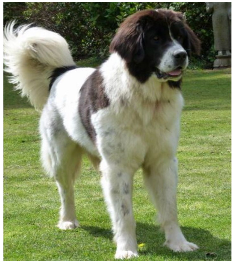
(Female) Bluemchen from the Pacific Coast, lives in Oregon, moving to Germany Litters D, E, H, K & N - total of 42 puppies