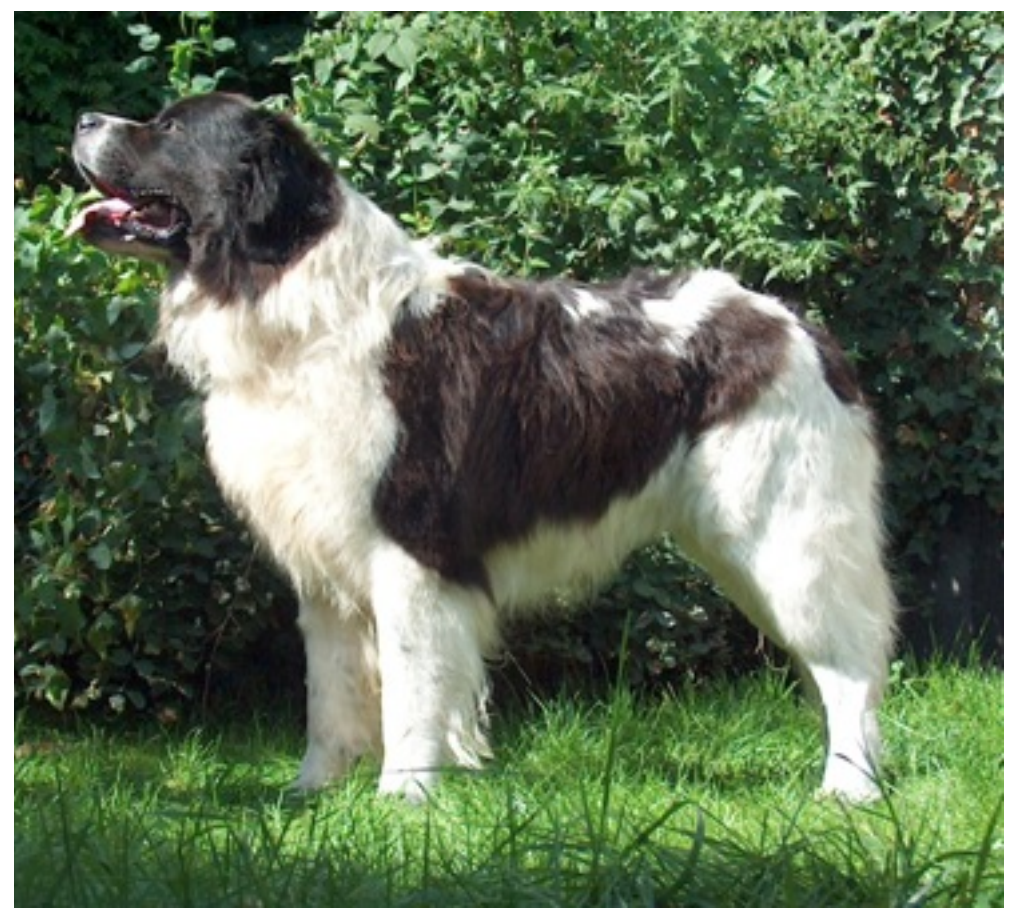
(Male) White'n Black Phantom (Randy) from Estonia, lives in Belgium Litters D & F - 15 puppies (frozen insemination)