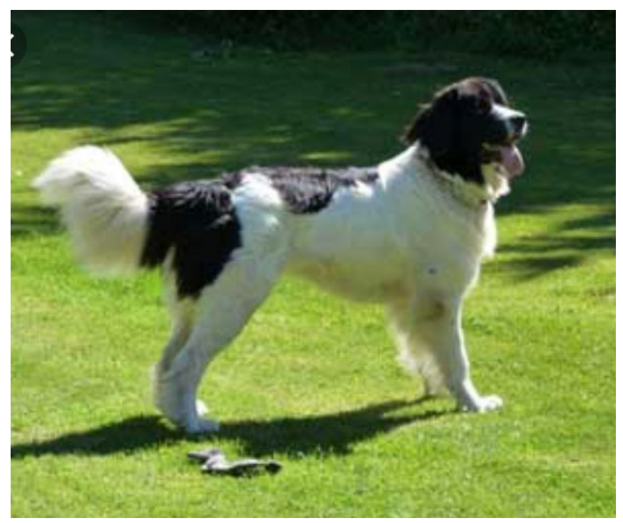
(Female) Izzy du Domaine Bachena's born in Belgium, lives in Oregon, moving to Germany Litters F & C – total of 6 puppies