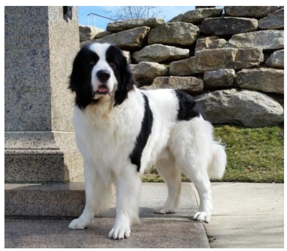
(Male) Casper vom Heidesee (Boo) from Germany, lives in New Jersey Litter N - 7 puppies (frozen insemination)