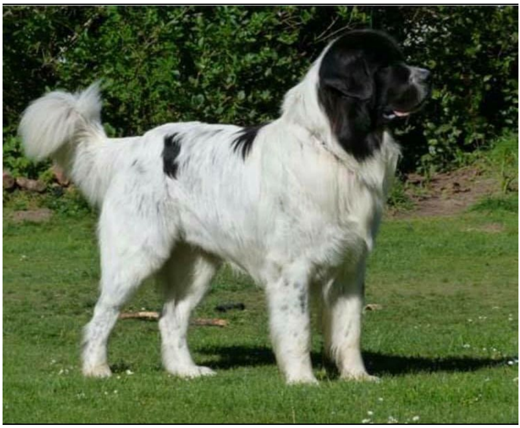
(Male) Arnold from the Pacific Coast (A-litter brother to Finn), lives in northern Washington Litter C - 1 puppy (natural breeding)